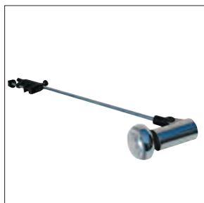
Lampa spot cu brat EUR 12.00 Cod 019.010.180.000