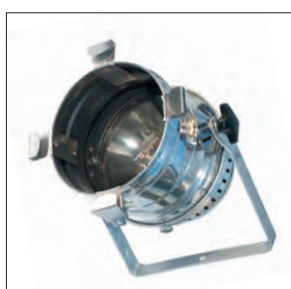
Reflector PAR64 500-1000W EUR 40.00 Cod 019.010.200.020