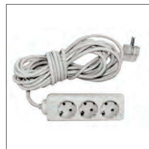
Prelungitor 230V, 10A, 5m EUR 10.00 Cod 019.010.279.000