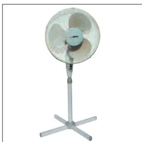
Ventilator cu picior EUR 7.00 Cod 025.010.500.020