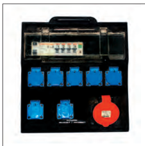
Panou Electric 380V/220V EUR 100.00 Cod 019.010.265.000