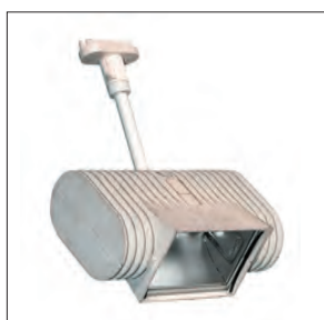
Reflector halogen SYMA STAR 300W EUR 35.00 Cod 019.010.200.006