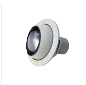
Lampa spot 100W EUR 12.00 Cod 019.010.170.000