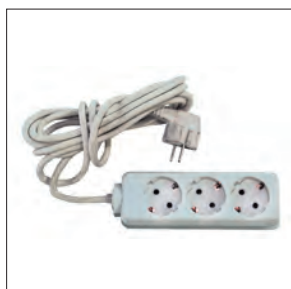
Prelungitor 230V, 10A, 3m EUR 10.00 Cod 019.010.277.000