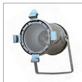
Reflector HIGHLITE HQI 150WEUR 35.00 Cod 019.010.390.000