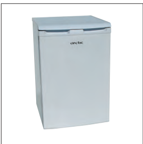
Racitor (140 l) EUR 24.00 Cod 025 010 070 010 (55 x 61 x 84 cm)