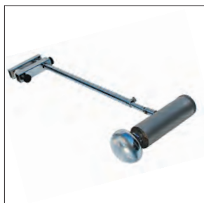
Lampa spot cu brat 100W EUR 12.00 Cod 019.010.181.000