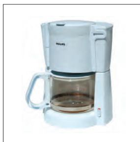
Filtru de cafea EUR 4.00 Cod 025.010.120.010