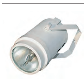
Reflector HQI 80W EUR 35.00 Cod 019.010.200.030