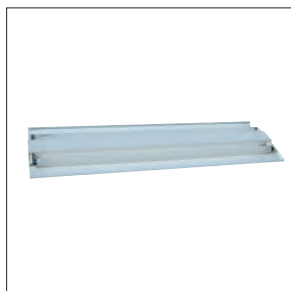
Corp fluorescent tip EUR 20.00 OCTANORM cu doua tuburi D-171 Cod 019.010.200.000