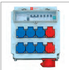
Panou Electric EUR 120.00 OCTANORM Cod 019.010.275.000