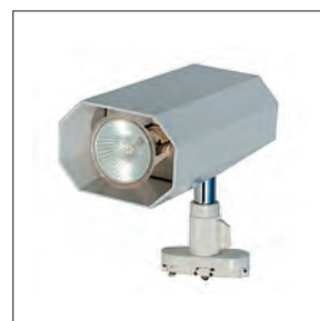
Spot halogen SY STAR 50W(A) EUR 15.00 Cod 019.010.186.000