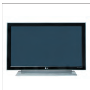
TV Plasma EUR 25.00/zi Cod 025 010 130 040