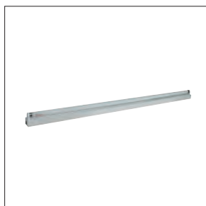
Lampa fluorescenta FIA EUR 15.00 cu instalatie electrica completa 1x40W Cod 019.010.110.000