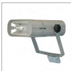
Reflector IVEN HQI 150W EUR 35.00 Cod 019.010.200.005