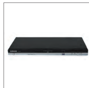
DVD Player EUR 40.00 Cod 025 010 130 030