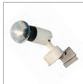
Lampa spot SS30 100W EUR 12.00 Cod 019.010.200.008