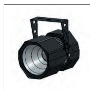
Reflector LED VIRGO EUR 40.00 40W 4350 LM 4100 K Cod 019.010.200.045