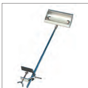
Reflector cu brat 300W EUR 35.00 Cod 019.010.200.010