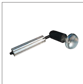
Lampa spot stut OCTANORM EUR 12.00 Cod 019.010.187.000