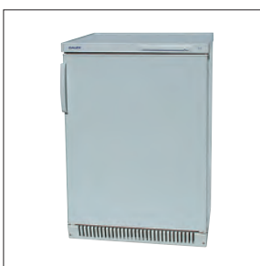
Frigider 125 FB EUR 24.00 Cod 025 010 070 031