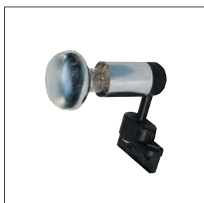
Lampa spot 100W EUR 12.00 Cod 019.010.188.000