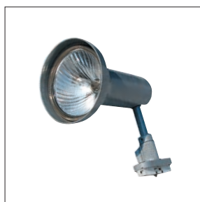
Spot halogen SY STAR 100W EUR 15.00 Cod 019.010.185.000