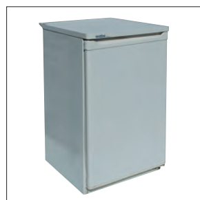
Frigider ARCTIC (180 l) EUR 44.00 Cod 025 010 070 020