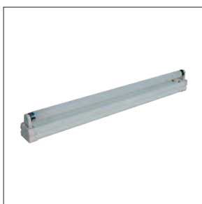
Corp fluorescent tip SS30 EUR 18.00 cu un tub D-170 - A Cod 019.010.190.001