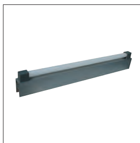
Corp fluorescent tip SS30 EUR 15.00 cu un tub D-170 Cod 019.010.190.000