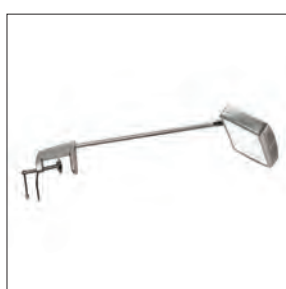
Reflector tija LED A++ EUR 35.00 16W 1100LM 4000K ARM33CM Cod 019.010.200.040