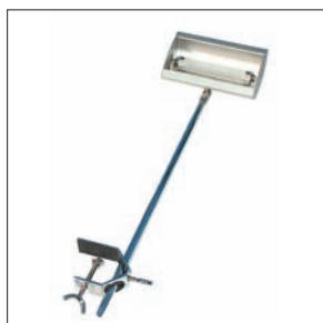
Reflector cu brat 300W EUR 45.00 Cod 019.010.200.010