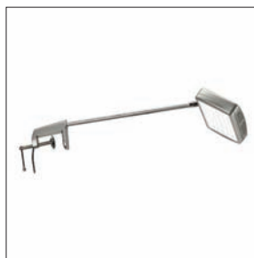
Reflector tija LED A++ 16W 1100LM 4000K ARM33CM EUR 45.00 Cod 019.010.200.040