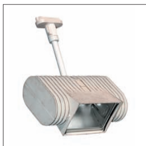
Reflector halogen SYMA STAR 300W EUR 45.00 Cod 019.010.200.006