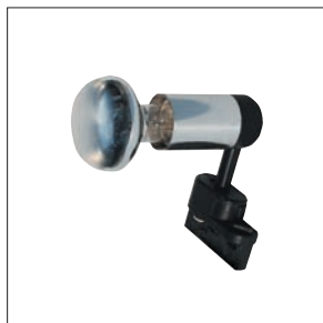
Lampa spot 100W EUR 18.00 Cod 019.010.188.000