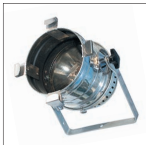
Reflector PAR64 500-1000W EUR 50.00 Cod 019.010.200.020