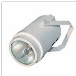
Reflector HQI 80W EUR 45.00 Cod 019.010.200.030