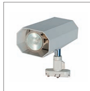
Spot halogen SY STAR 50W(A) EUR 21.00 Cod 019.010.186.000