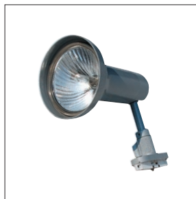
Spot halogen SY STAR 100W EUR 21.00 Cod 019.010.185.000