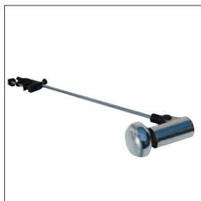
Lampa spot cu brat EUR 18.00 Cod 019.010.180.000