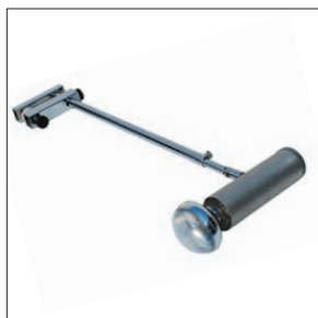
Lampa spot cu brat 100W EUR 18.00 Cod 019.010.181.000