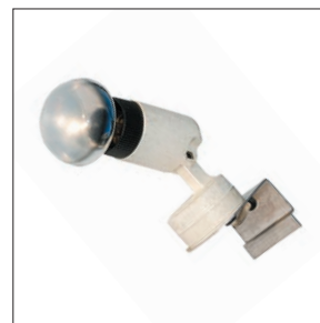
Lampa spot SS30 100W EUR 18.00 Cod 019.010.200.008