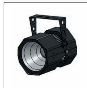
Reflector LED VIRGO 40W 4350 LM 4100 K EUR 50.00 Cod 019.010.200.045