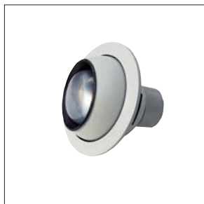
Lampa spot 100W EUR 18.00 Cod 019.010.170.000