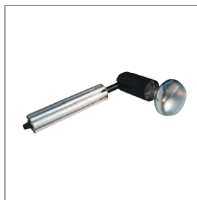
Lampa spot stut OCTANORM EUR 18.00 Cod 019.010.187.000