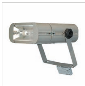
Reflector IVEN HQI 150W EUR 45.00 Cod 019.010.200.005