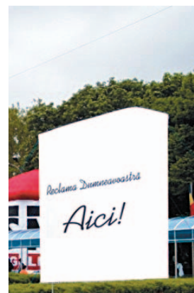
ADVERTISING MASCOTS DISPLAY