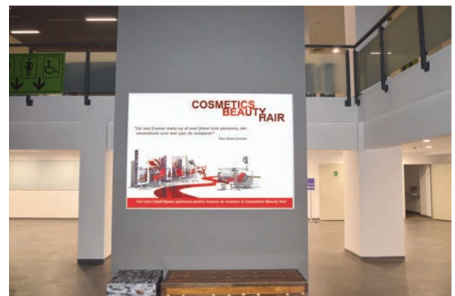
SNAP FRAME, SIZE 200X140 CM