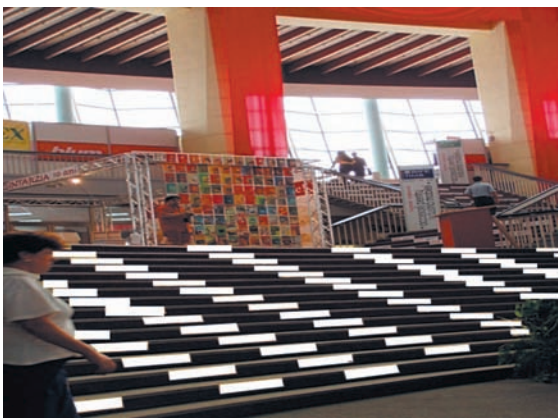
STICKERS DISPLAY ON PAVILION'S STAIRS AND FLOOR