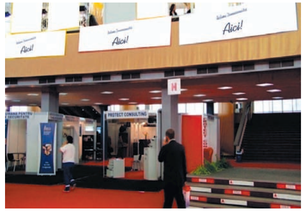
BANNER DISPLAY ON PAVILION A, FRIEZE 4.50