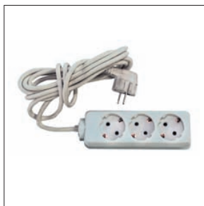
Prelungitor 230V, 10A, 3m +EUR 18.00 + Cod 019.010.277.000