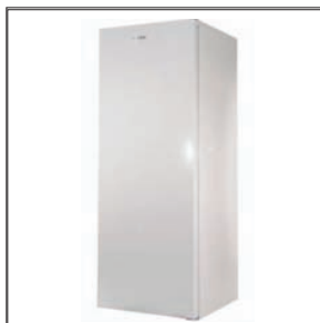
Frigider ARCTIC 255 I EUR L.00 Cod 025 010 020 199