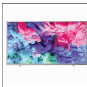
TV LED SMART 4K, UHD ultrasubtire EUR 55.00/zi (diagonala ecran: 126 cm) Cod 025 010 130 045