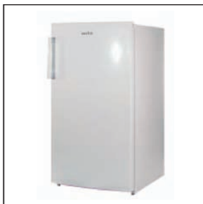
Frigider ARCTIC FB 155 EUR 36.00 Cod 025 010 020 198