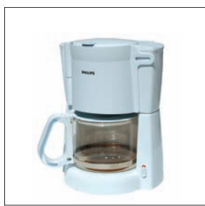
Filtru de cafea EUR D C.00 Cod 025.010.120.010